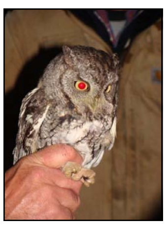
SOMERSET COUNTY CONSERVANCY