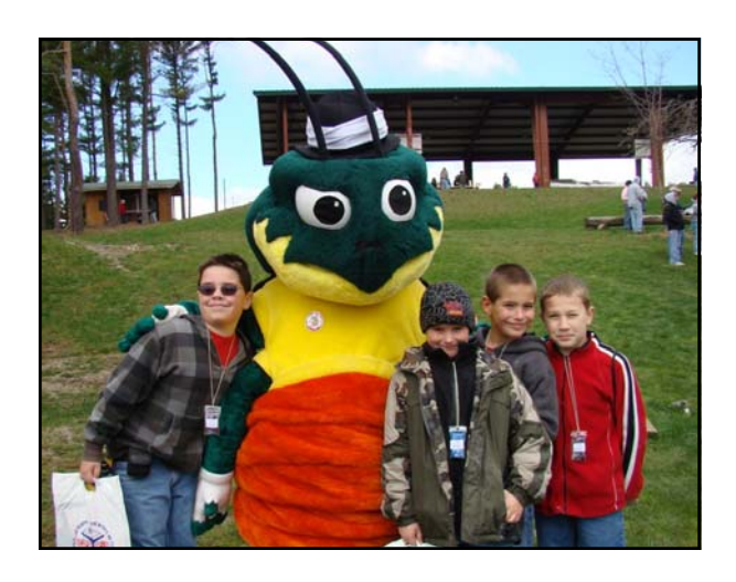
CT Boys with Litterbug – Conemaugh Township school students pose with the Litterbug at Outdoor Adventures 2009.

Please plan to join in Outdoor Heritage events. Volunteers are needed for many activities. For a growing calendar of events and information on how to get involved, visit the Outdoor Heritage website at <a href="https://www.ohmonth.com">www.ohmonth.com</a>.